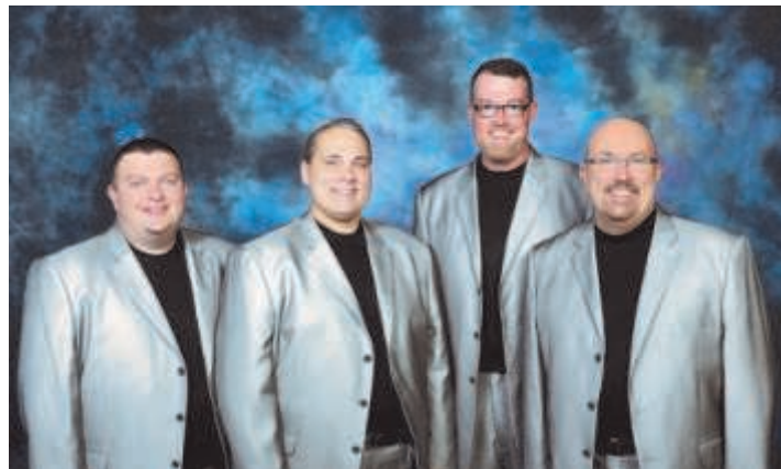
The Jones Boys