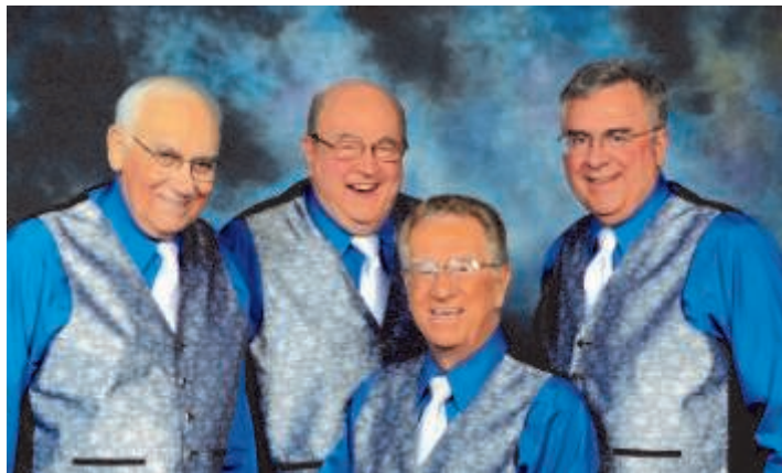
O K JOURNEYMEN