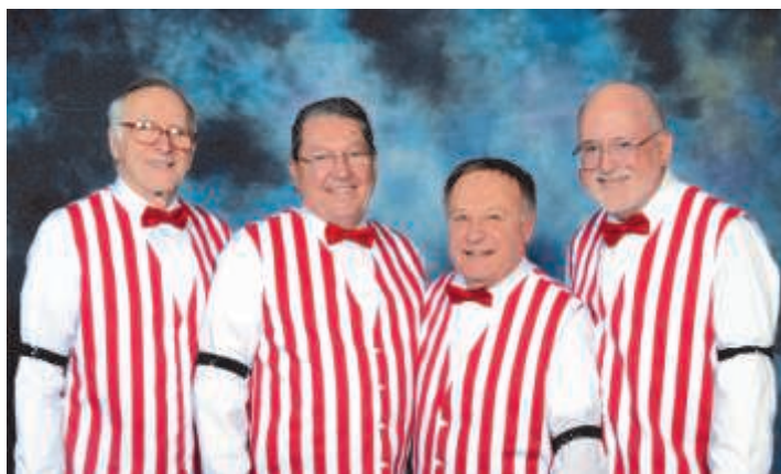
Tones of Fun