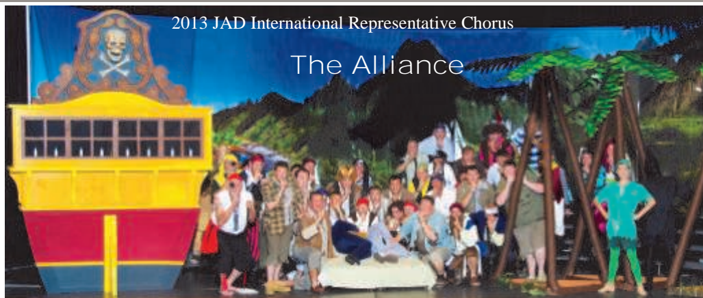
2013 JAD International Representative Chorus