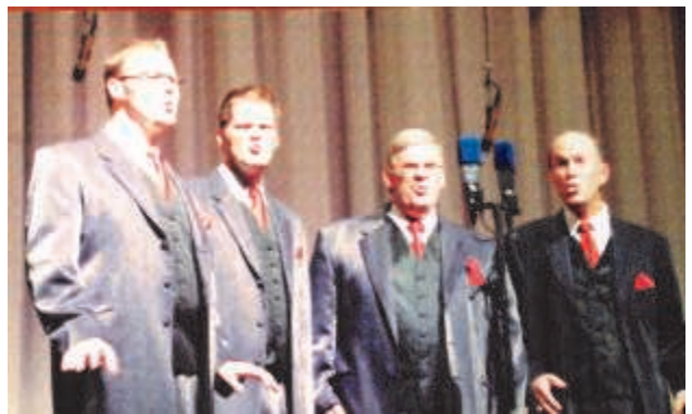
The Franchise Quartet