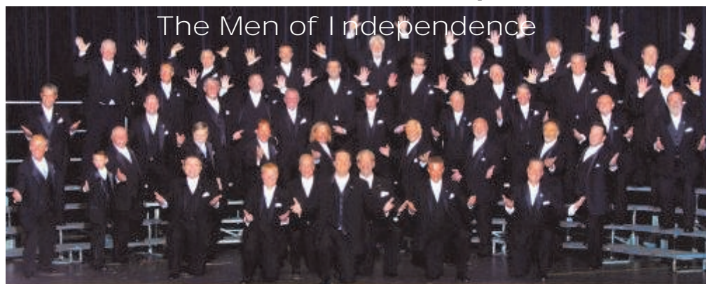
The Men of Independence