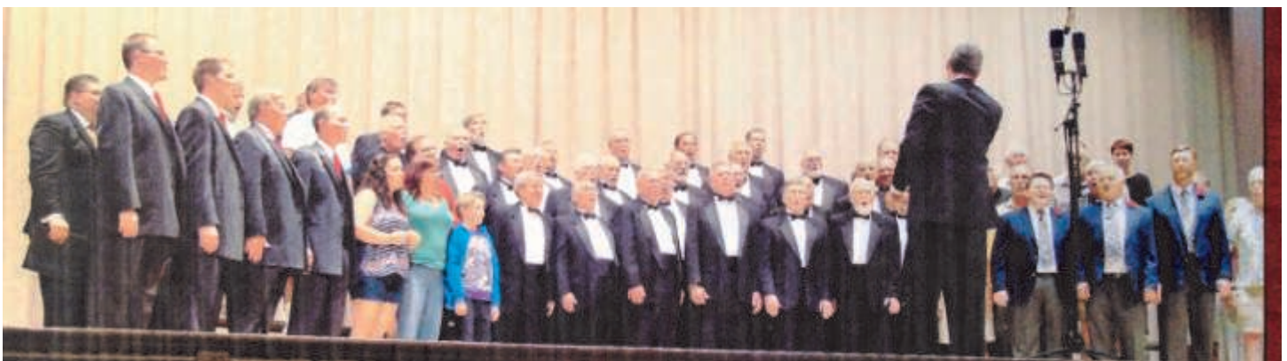
Grand Finale; Canton Chorus, Guest Quartets and Barbershoppers from the Audience