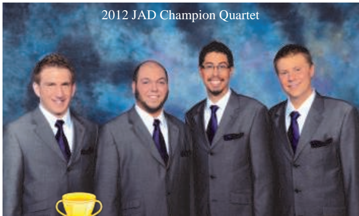
2012 JAD Champion Quartet