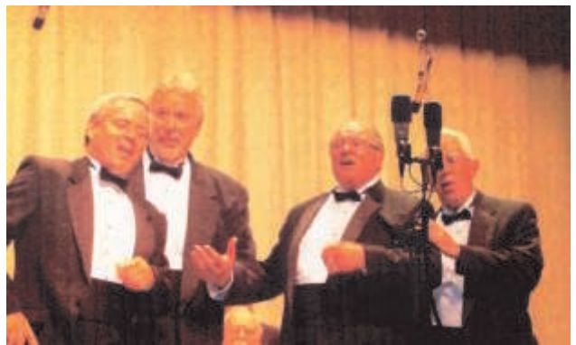
Lightly Seasoned Quartet