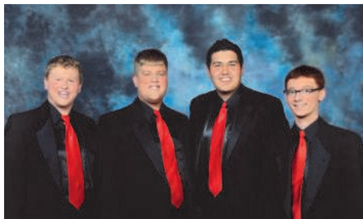
The Darlington Brothers