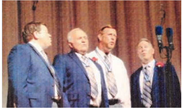
Over Easy Quartet

AS A SPECIAL NOTE , next year’s Annual Lakeside Show will be Saturday, August 24, 2013 (ONE WEEK EARLIER than the previous years). This annual Barbershop Show is always an ENJOYABLE evening of singing and fellowship. REMEMBER , mark your calendar NOW and plan to be there for another GREAT Barbershop Show. You’ll have a WONDERFUL time. 🎵