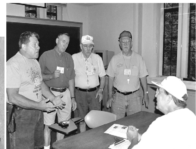
Four gangsters from Xenia pleading their case before the 'Judge'