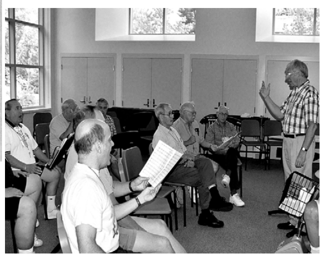
Polecat class, only wild - when the bartones mess up