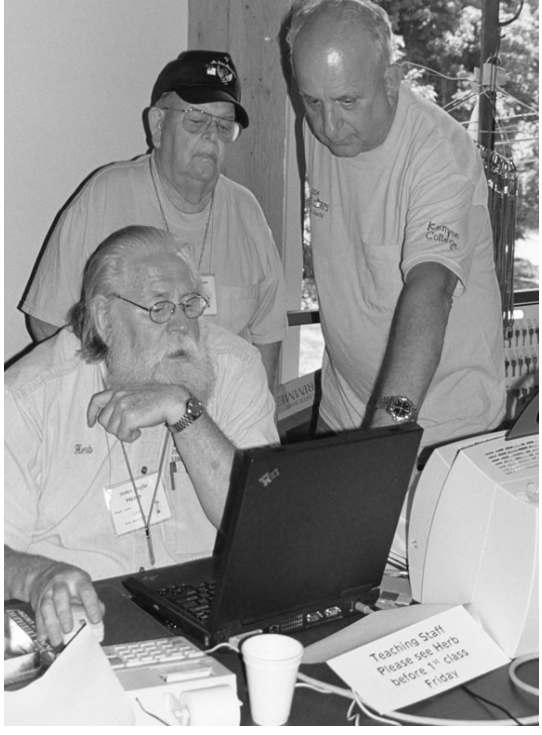
"But I know he's here - I saw him!" (typical registration day)