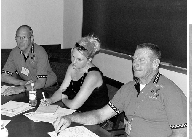
'Wannabe a Coach' learners learning