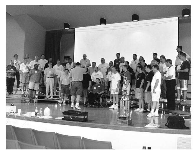
Alliance-style treadmill excercising for Louisville