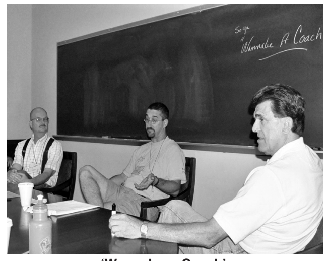
'Wannabe a Coach' teachers teaching